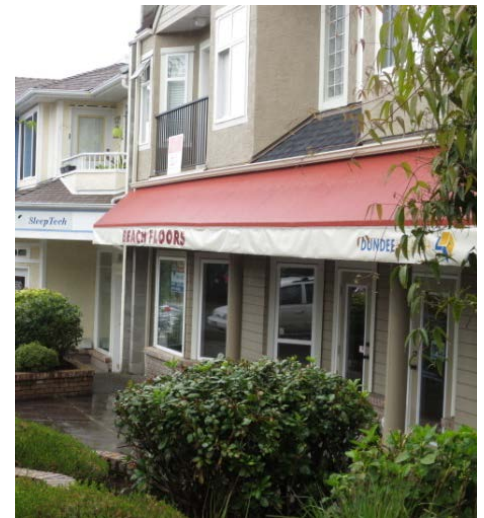
Each business premise under an awning is allowed one sign.