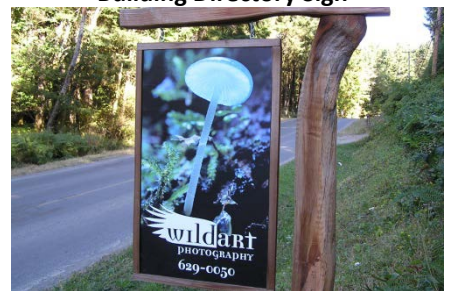
Home Occupation Signs