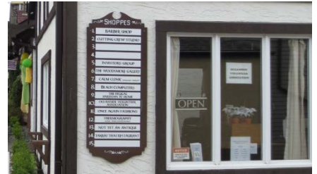
Building Directory Sign