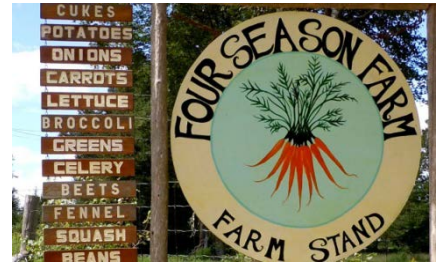
Farm Product Sign