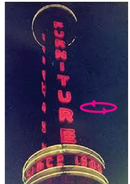
Animated Signs (rotating)