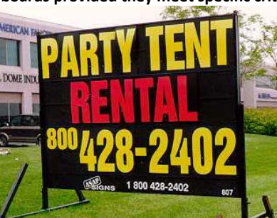
Portable Changeable Copy Signs