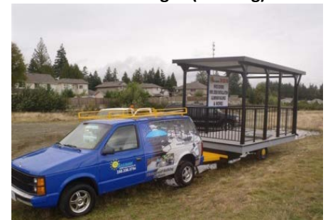
Signs attached to parked vehicles for the principle purpose of advertising