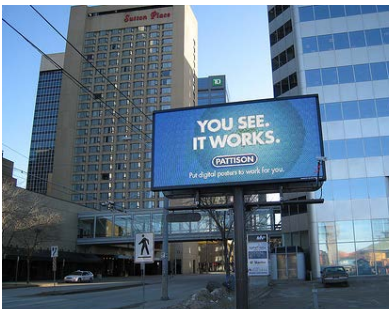
Digital billboards. Signs on institutional properties may have electronic message boards provided they meet specific criteria