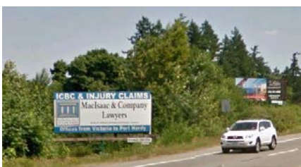
Off premise signs are not allowed with the exception of community event signs, see Part 4. *