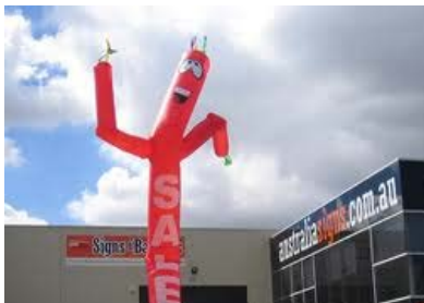
Wind Activated Signs