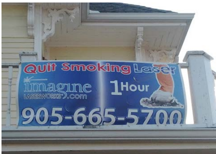
Signs mounted on a balcony