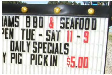
Animated Signs (flashing lights)