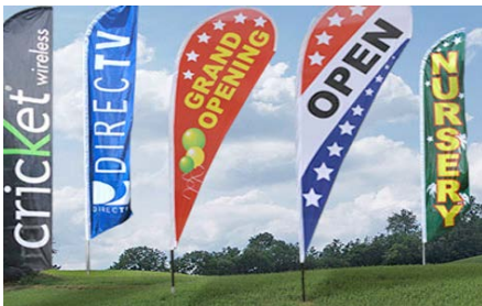
Wind Activated Signs