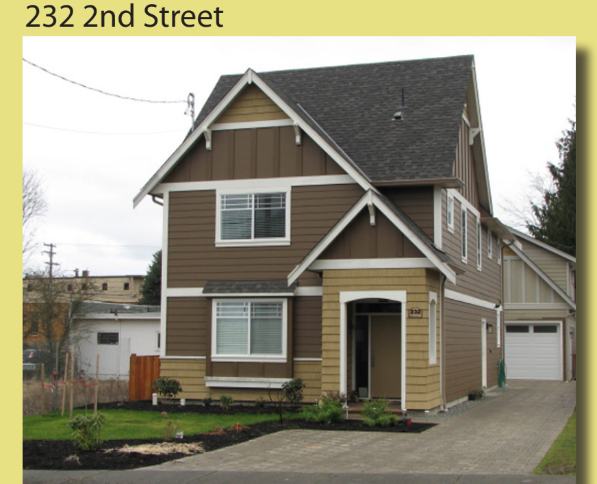
Two examples of recent infill development under the Old Orchard Area Development Permit Guidelines