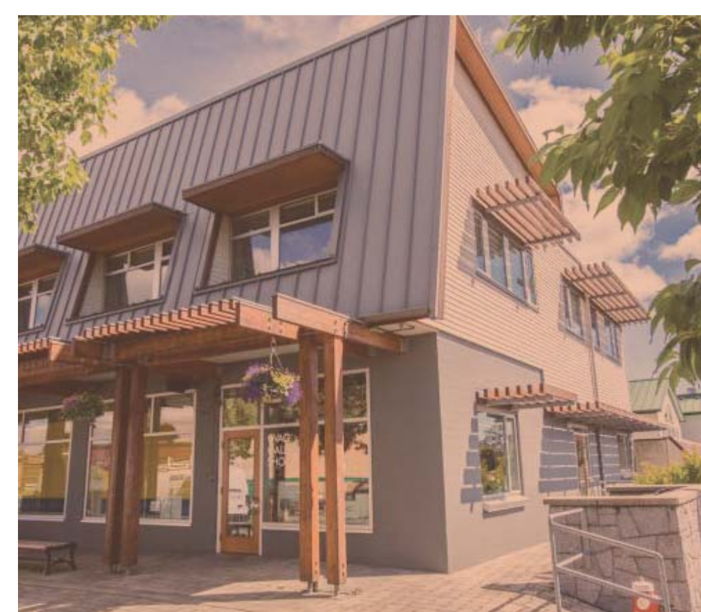
Our downtown and the neighbourhoods in which we live, including the homes we build, places we shop, and the parks in which we play