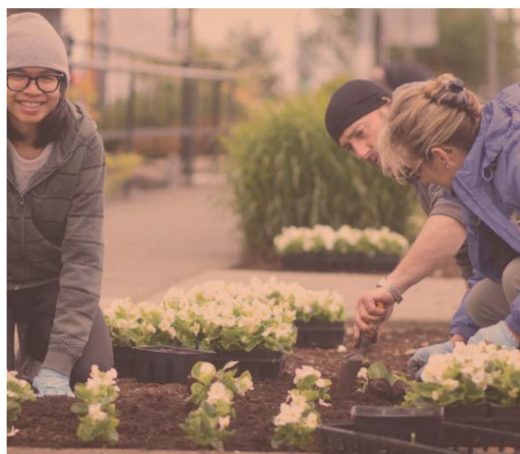
Our community character