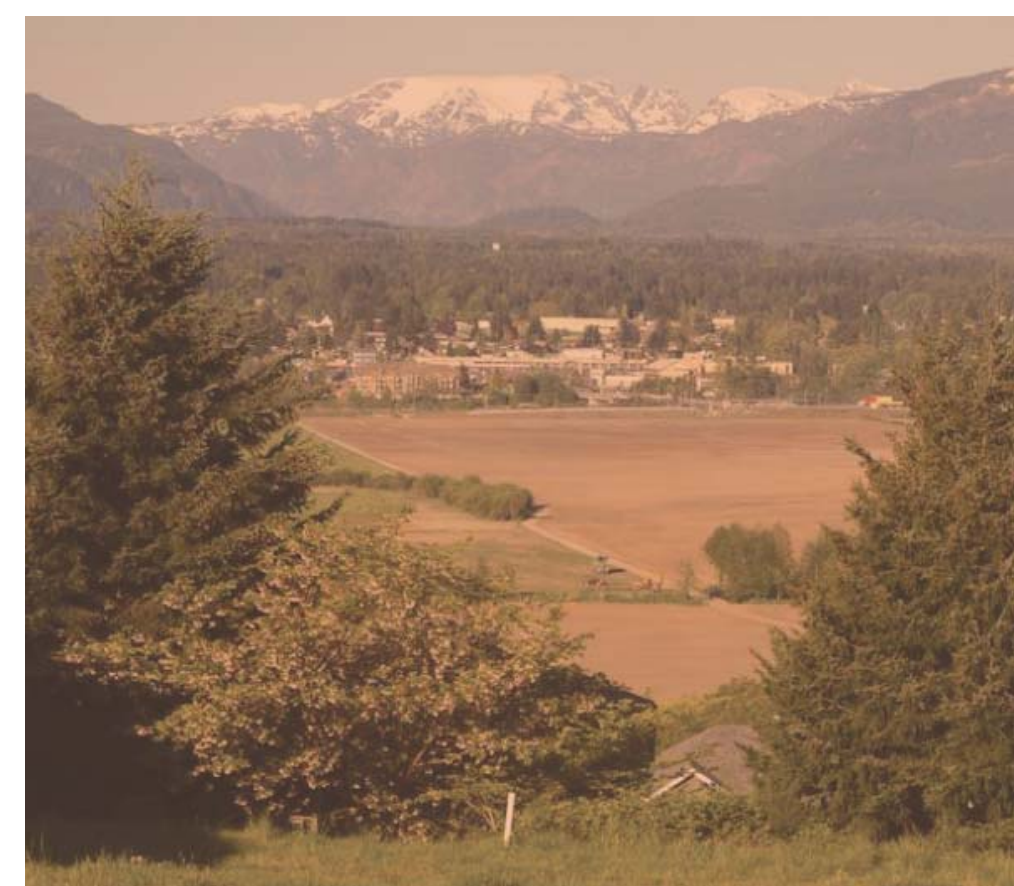
Protection of our ecological and agricultural areas