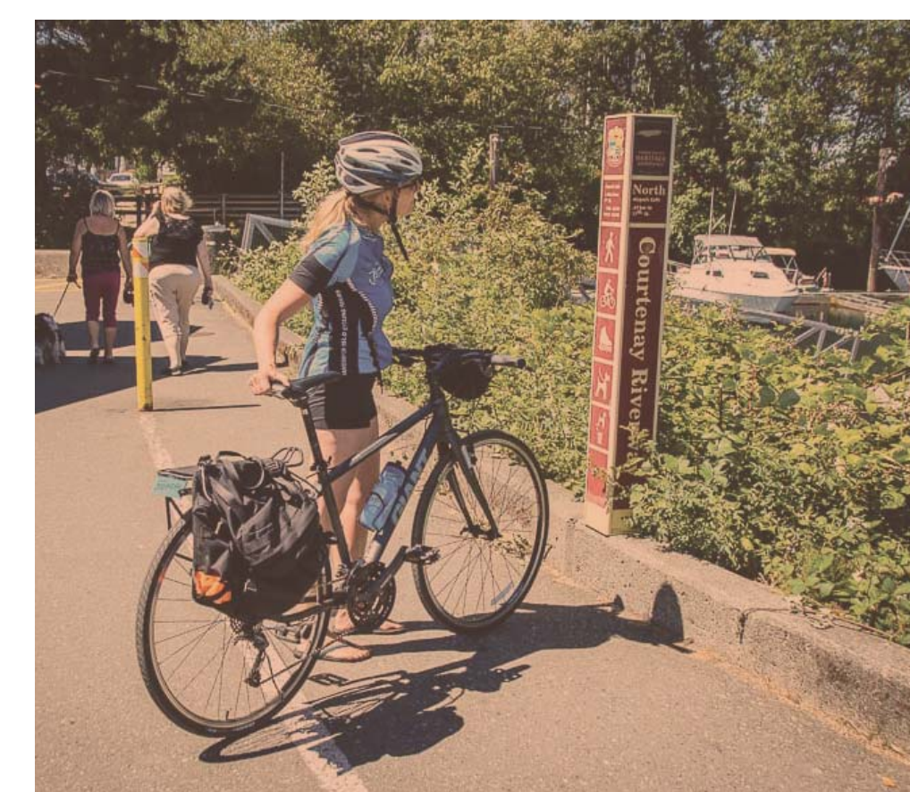
Our transportation choices, whether its walking or cycling, taking transit, or driving – which in turn affects our health