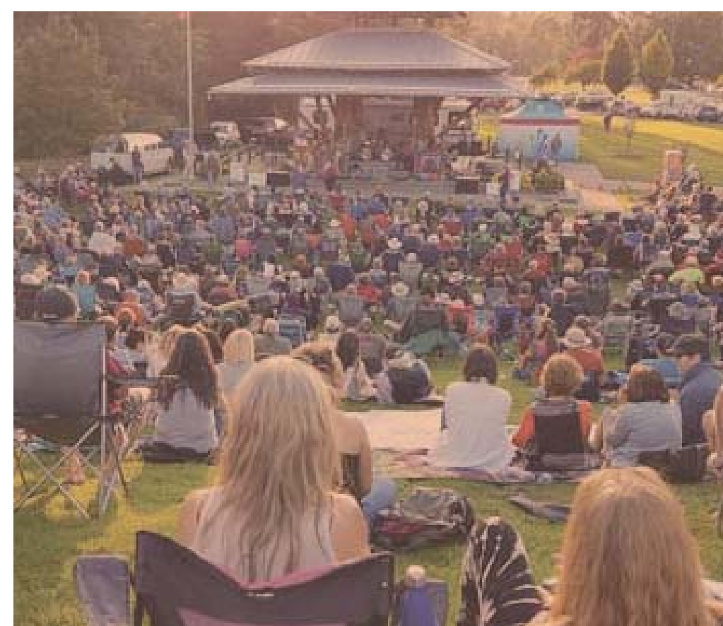
Our gathering spaces, both formal and informal