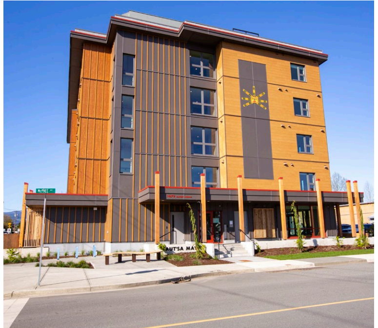
Nautsa ma'wt affordable housing for Elders and people with disabilities

Objective: To utilize inclusive policies and planning tools to promote and expand the availability of accessible housing options throughout the community.