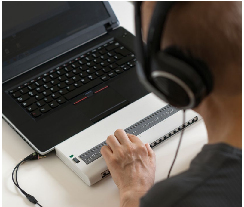
Blind person using braille display and screen reader

Objective: To enhance the clarity and accessibility of municipal communications so that information is easily understood by a diverse public.