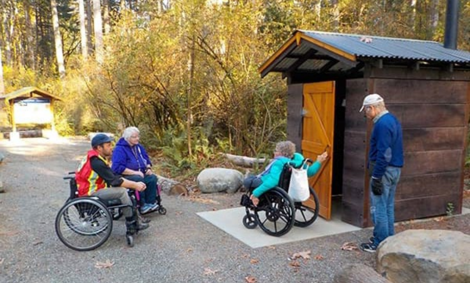
Seal Bay washrooms in collaboration with CVRD