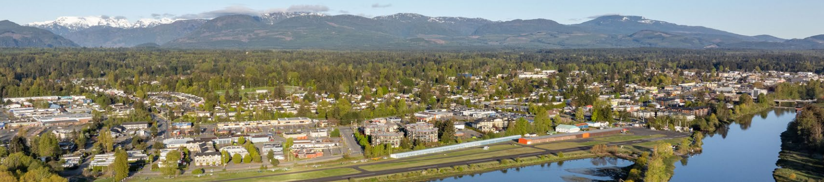
Aerial view of the Comox Valley