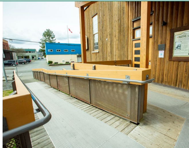
Wheelchair ramp at the Native Sons Hall

Objective: To improve accessibility in the built environment, the City will focus on identifying barriers, assessing standards, and integrating accessibility into future infrastructure planning.