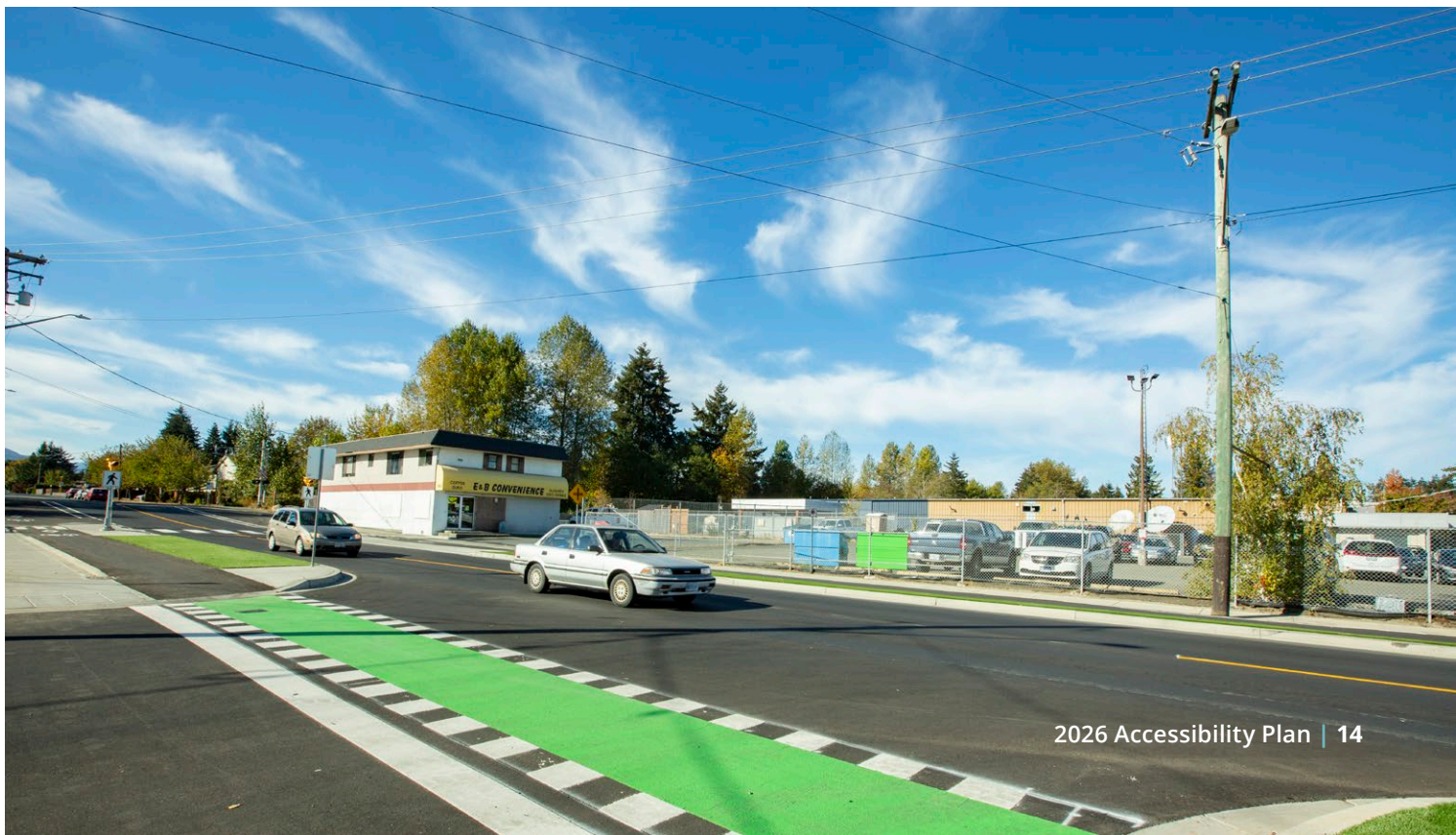
17th street intersection with bike lane markings