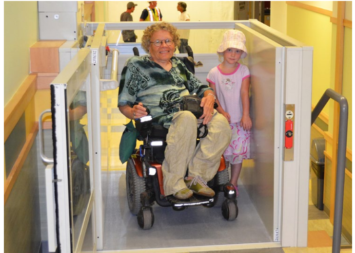
Wheelchair lift at the Lewis Centre

Objective: To foster an inclusive workplace culture and enhance employment practices so that staff of diverse abilities are recognized, valued, and supported to thrive.