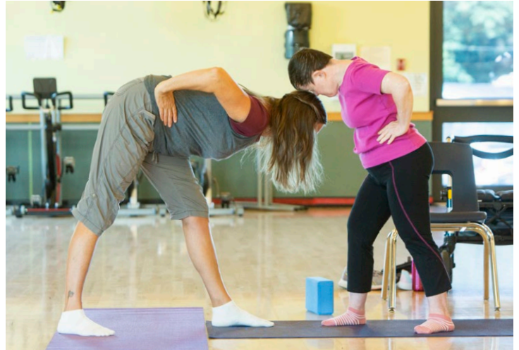
Adapted yoga class at the Lewis Centre

Objective: To adapt and enhance municipal service delivery so that programs and services are respectful, inclusive, and convenient for people of diverse abilities.