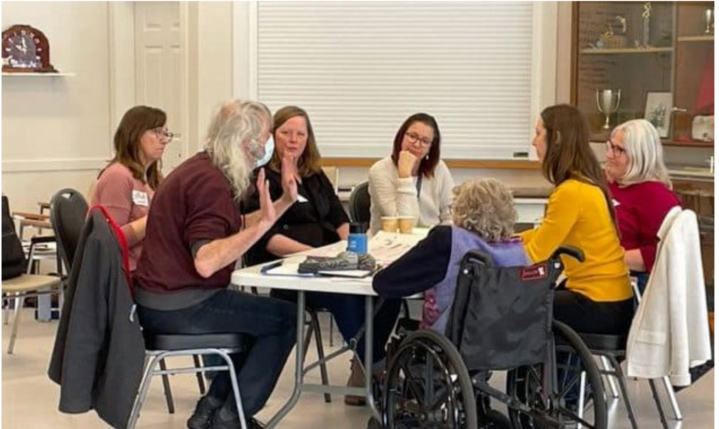
Comox Valley Social Planning Society: Accessibility committee meeting